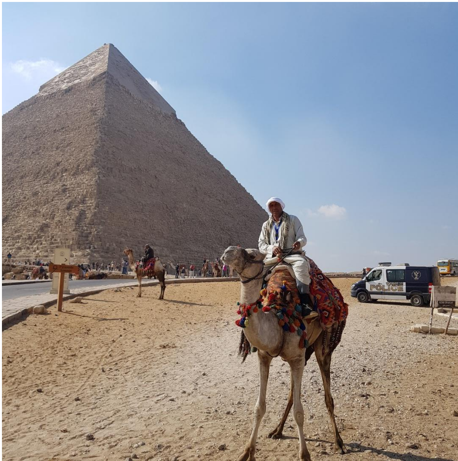
Cairo Gize 2024